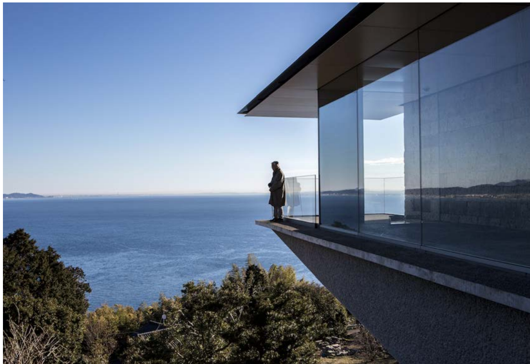
Each structure has been designed with geography in mind, to perfectly frame a sea-view backdrop at every turn

steel precisely positioned to capture the sunrise just one day of the year, on Winter Solstice.